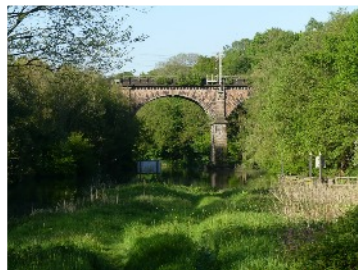
Vale Royal Viaduct carries the West Coast Main Line over the River Weaver. It was built by renowned engineer Joseph Locke in 1837 as part of the Grand Junction Railway between Crewe and Warrington.