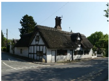
Whitegate Cottage is a Grade-II-listed thatched cottage in the pretty village of Whitegate.