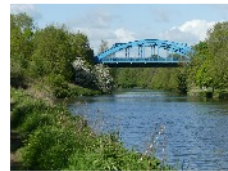
Hartford Blue Bridge was built in 1938 with Art Deco details. It is rumoured to have had a lifting section to allow tall vessels to pass below the central span, but in fact this appears to have referred to a temporary builders' platform used during construction. It replaced a single-span stone bridge.