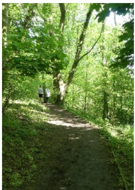
Marshall's Arm is a local nature reserve centred on an abandoned channel of the River Weaver.