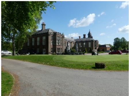
The visible parts of the house at Vale Royal Abbey , now a golf clubhouse and events venue, date from the 19th century, but inside the building are parts of the medieval cloister and monks' refectory from the monastery founded by Edward I in the late 1200s. The abbey church, long demolished, was one of the largest in England.